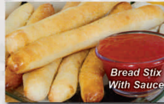
Bread Stix With Sauce

Bread Stix 8-10 Freshly Baked Bread Stix. 3.00